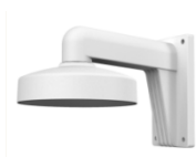
HIA-B401-110T Wall Mount